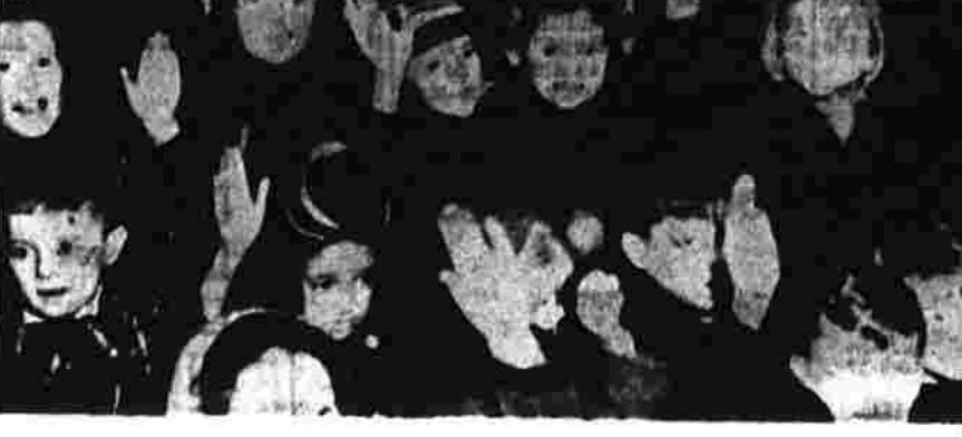
Hundreds of youngsters from babies in arms to first and second graders, enjoyed a fine Christmas party yesterday afternoon sponsored by the local WPA toy lending library staff at Chestnut street.

After a floor show and caroling the youngsters were receiving their special Christmas service Sunday morning at 10:45.